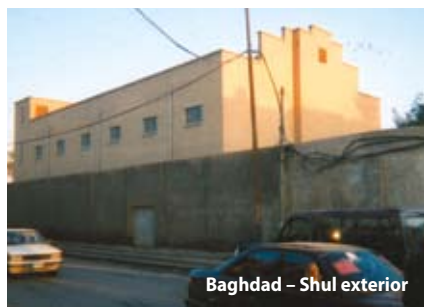
Baghdad – Shul exterior

“I HAVE VISITED SHULS THROUGHOUT THE WORLD, AND FOUND INTERESTING JEWISH CONNECTIONS IN THE MOST UNEXPECTED PLACES.”