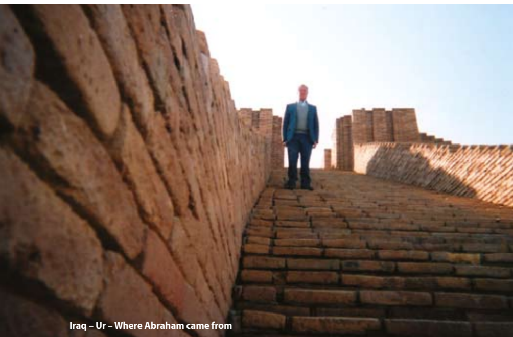
Iraq – Ur – Where Abraham came from